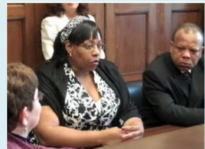
Above, members of St. Camillus visit their Senator to share their concern about war in the DRC. Below, they sell crafts.

Back at the parish, they stepped with the charitable works foot by holding a craft sale to benefit Catholic Relief Services programs that assist victims of war in the DRC.