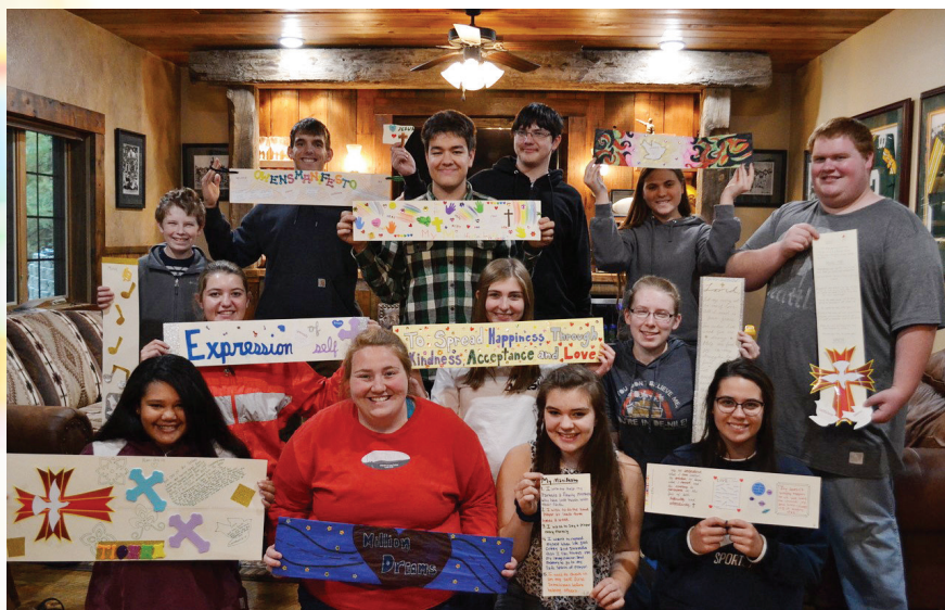
Confirmation candidates discern and create personal "Manifesto" banners as part of their retreat.