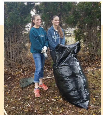
Students help with yard cleanup for elderly parishioners during our annual Y.E.S. (Youth Engaged in Service) Day