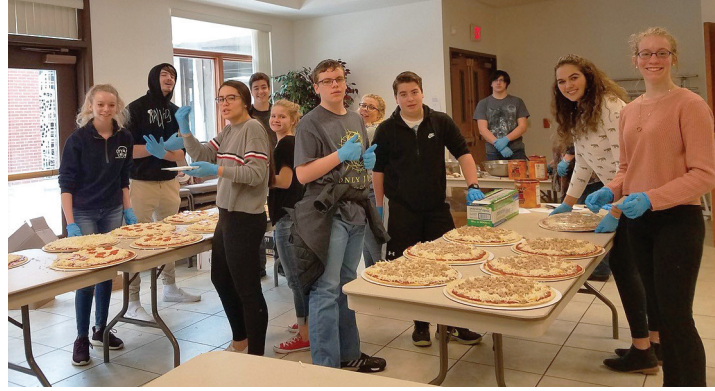
Making pizzas for the annual Superbowl pizza fundraiser