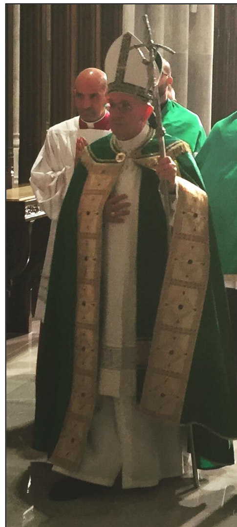
Pope Francis made use of the Scorzelli ferula, first used by Blessed Paul VI in 1965.

Although Pope Francis was present at a number of important non-liturgical events on his recent journey, such as his historic address to the United States Congress and his visit to a Philadelphia prison, the liturgies he celebrated will no doubt stand in our memories as moments when the sacred liturgy gathered us together as one Church built on the rock of Peter.