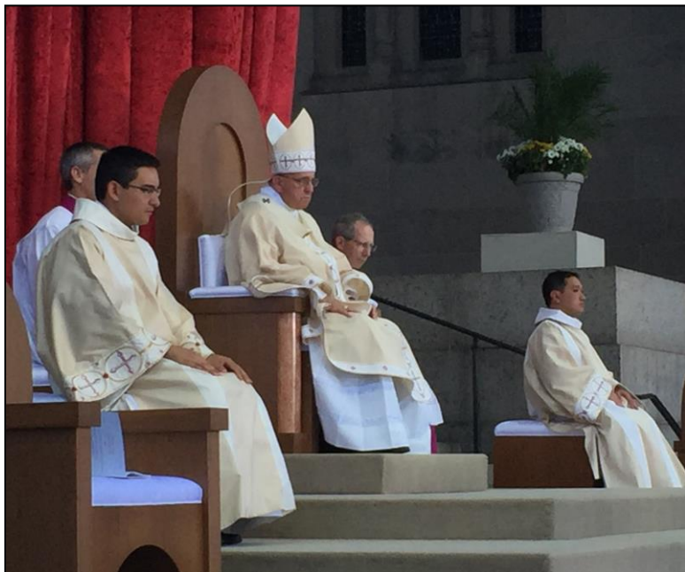
Noble simplicity was a constant feature of the Holy Father's liturgical celebrations during his visit to the United States.

The Holy Father's much anticipated series of liturgical celebrations in the U.S. began with a celebration of Midday Prayer at Washington's Cathedral of St. Matthew the Apostle on Wednesday, September 23. Following a