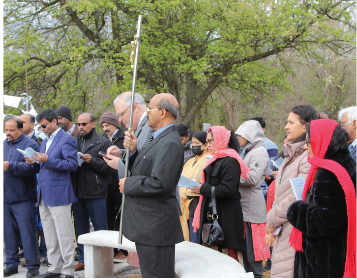
In Gaithersburg, MD, on a chilly Palm Sunday morning parishioners gather at the driveway entrance to Our Lady of Perpetual Help Syro-Malabar Catholic Mission to dedicate a grotto shrine to Our Lady prior to processing to the Church for the Palm Sunday celebration of Holy Qurbana.