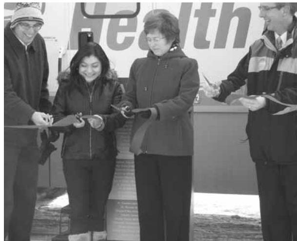
COMMUNITY LEADERS AND AMOS MEMBERS CUT THE RIBBON TO LAUNCH THE NEW MOBILE CLINIC.