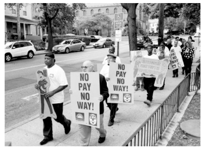
Workers march in "No Pay No Way" campaign to fight wage theft.

"We adopted fighting wage theft as our primary issue," Ann says. And CCHD resumed making grants to support its staff of one full-time and one part-time employee.