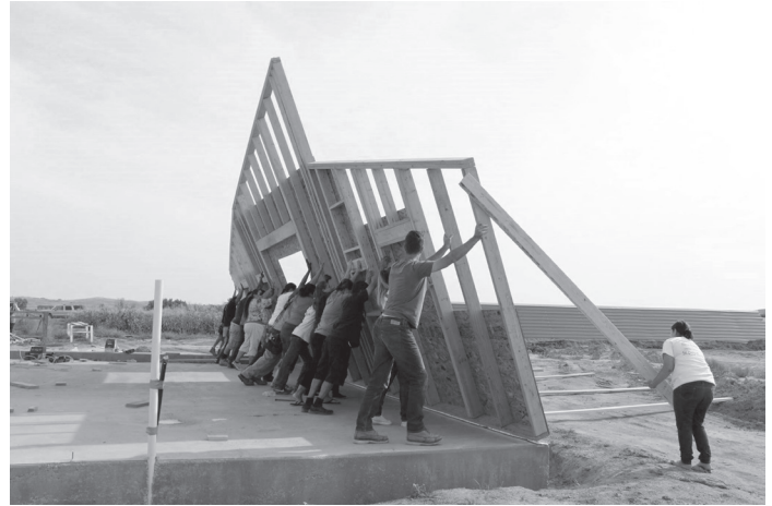
Thunder Valley CDC staff raises a wall for the Sustainable Agriculture Education Center where youth and families will be able to learn about healthy local foods.

“Thunder Valley CDC is an initiative by and for the people on the reservation. We need more of this. They’ve turned the tables around by going out into the community and asking people what they need.