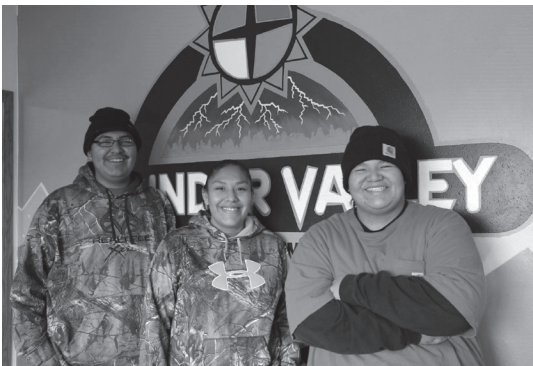
These young adults were part of the Workforce Development Through Sustainable Construction Program where they learned construction skills, advanced their education, and developed individual success plans.

Thunder Valley CDC implements a Workforce Development Program that includes training in sustainable construction methods. People age 18-26 years old join a small 10-month learning cohort where they create individualized success plans that may include education goals, addiction treatment, and nutritional changes. They learn construction skills, gain confidence, and create affordable housing for their neighbors.