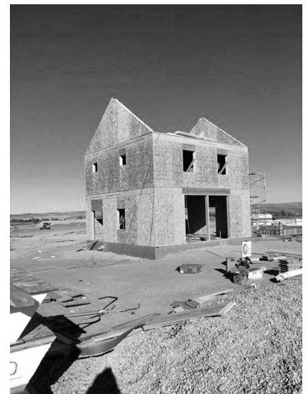
Affordable, energy efficient housing at the Regenerative Community Development will provide more opportunities for homeownership on the Pine Ridge Reservation.