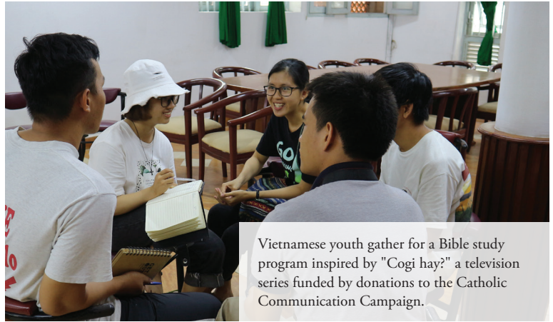
Vietnamese youth gather for a Bible study program inspired by "Cogi hay?" a television series funded by donations to the Catholic Communication Campaign.

To learn more about this collection or to find additional resources, please visit www.usccb.org/lccc .