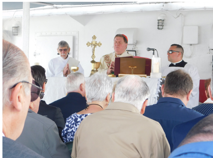
Mass and blessing of the port with Cardinal Tobin CSsR

W. Tobin, C.S.s.R. The Blessing of The Port Cruise was a total success with a record turnout of parishioners and friends of the Catholic Church. For the first time, a full Mass by Cardinal Tobin was held on the Pilot Boat New York.