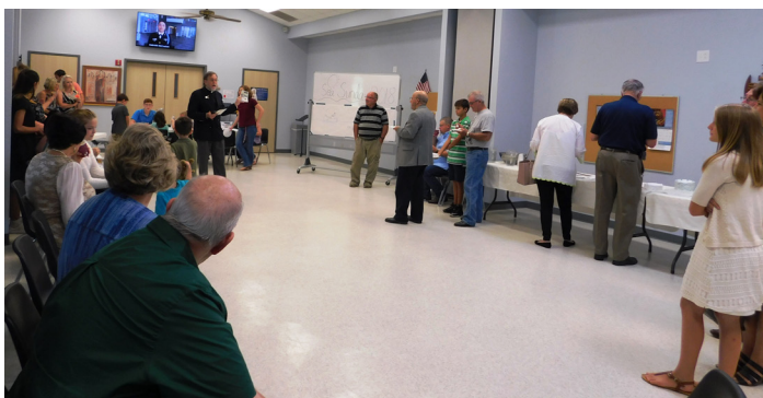
Reception After Sea Sunday Mass with Childrens Corner