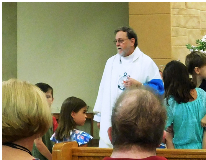
Homily at Sea Sunday Mass

and also to grow into a more profitable size.