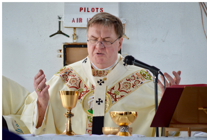
His Eminence Joseph W. Tobin, Cardinal of the Archdiocese of Newark during the celebration of Mass