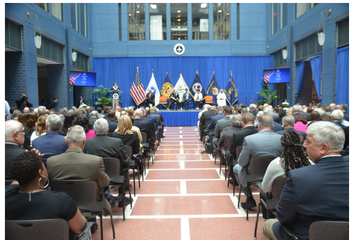
US Department of Transportation and guests observe National Maritime Day Ceremony