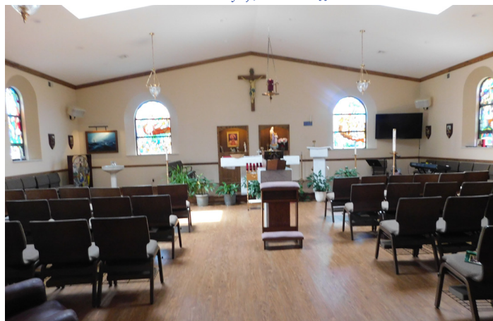
Stella Maris Chapel serving Port Newark and Port Elizabeth, New Jersey