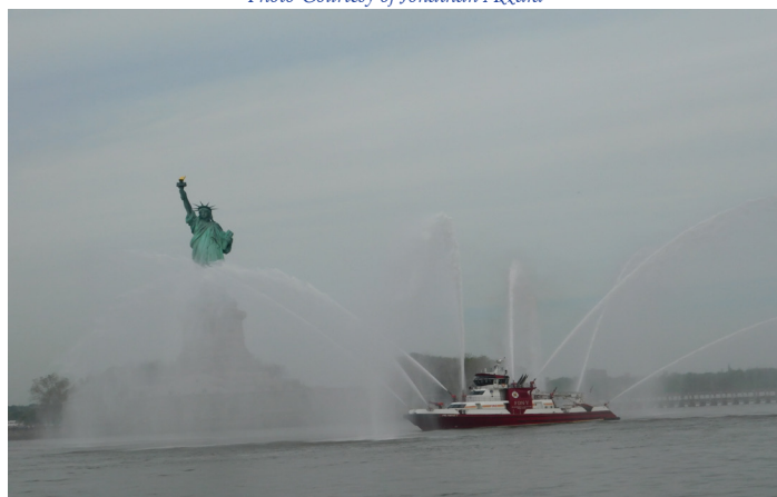
As the vessel proceeded up New York Bay toward the Statue of Liberty, the NYFD Fireboat, THREE FORTY THREE, welcomed Cardinal Tobin with a water cannon salute