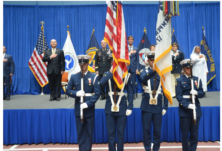
Honor Guard and Opening Ceremony, Maritime Day at the US Department of Transportation

The president's Proclamation can be view here: https://www.whitehouse.gov/presidential-actions/proclamation-national-maritime-day-2019/