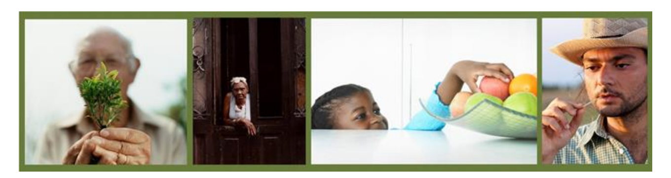
CCHD. Working on the Margins. Major Environmental Justice Initiatives Funded by CCHD