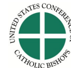
United States Conference of Catholic Bishops Catholic Campaign for Human Development Dept. of Justice, Peace and Human Development Migration and Refugee Services Secretariat of Cultural Diversity in the Church Secretariat of Pro-Life Activities