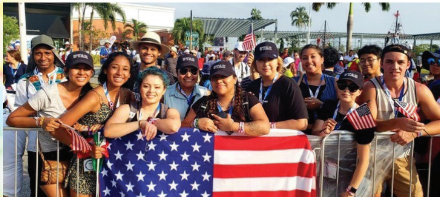
The Diocese of Salt Lake City used a special grant from Catholic Home Missions to help send 14 young adults from six parishes to World Youth Day in Panama in January 2019.