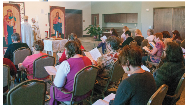
About 30 women gather for the closing liturgy of an annual women’s retreat, sponsored by the Byzantine Catholic Cultural Center.