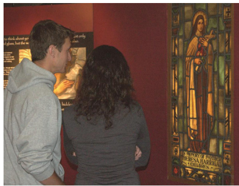
Visitors enjoy a display of stained glass windows in Cleveland, Ohio. The exhibit was sponsored by the Byzantine Catholic Cultural Center.