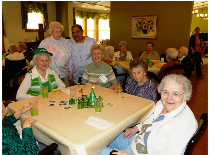
Sisters, volunteers, and aide enjoying a party.

cerns. We assure them that they are always welcome to visit. Now when a sister asks, “What do I do now?” we are so pleased to be able to answer the question and sisters are content, knowing their day will be interesting and meaningful.