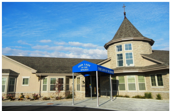
Our Lady of the Angels, Milwaukee, WI

The heart of all of this planning and collaboration was to provide our sisters with a meaningful and dignified life. These sisters need to know that they are not alone but that they are supported in every way by a caring and compassionate staff. Community Care provides for their physical and psychological needs. The day is structured with a variety of activities to stimulate thinking. They also