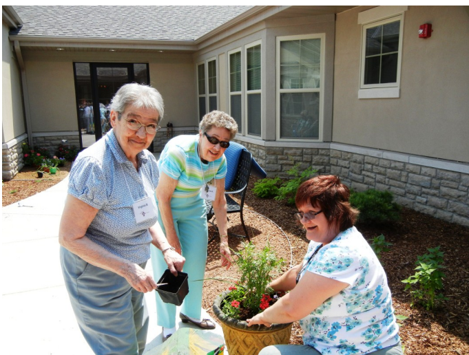
Activity Director and sisters in a courtyard garden at Our Lady of the Angels

In addition, we assist the families of the sisters by communicating with them about their con-