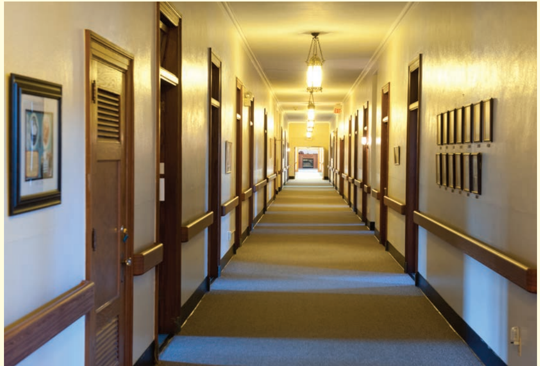
Sisters of St. Joseph of Chambéry, West Hartford, Connecticut

These motherhouse photos, provided by participants of the Planning and Implementation Assistance program, highlight the common challenges religious communities face when it comes to property planning and divestment. Designed for another era, these extremely large, single-use properties are expensive to maintain, hard to sell, and often even harder to renovate. Long, narrow hallways, steep stairwells, and poor lighting pose numerous obstacles for handicap accessibility, while bedrooms and bathrooms are ill-equipped for senior members.