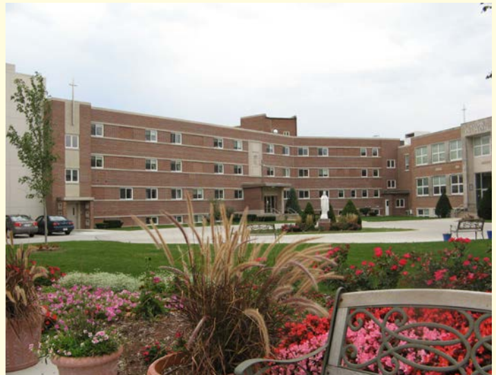
Servants of Mary, Omaha, Nebraska