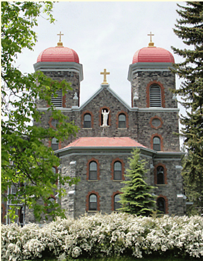
Monastery of St. Gertrude, Cottonwood, Idaho