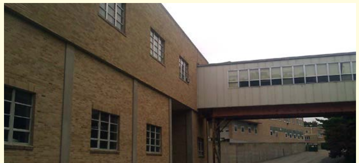
Daughters of St. Paul, Boston, Massachusetts