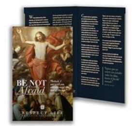
Read | Download

"The Lord says to us, 'Do not fear: I am with you' (Isaiah 41:10). He speaks these words not as one who merely observes our pain, but as one who experienced immense suffering. And the very wounds that bear witness to his suffering indicate the essence of our identity and worth: we are loved by God. Reflecting on the healed wounds of the Risen Christ, we see that even our most difficult trials can be the place where God manifests his victory. He makes all things beautiful. He makes all things new."